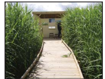
Boardwalk and hide July 2009