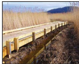
Completed boardwalk March 2009

In addition, Impact Leisure dug and lined a new ‘dipping pond’ which had timber decking along two sides. Working closely with the centre staff, other works were undertaken to help improve this section of the reserve.